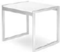
End Table Coffee Table