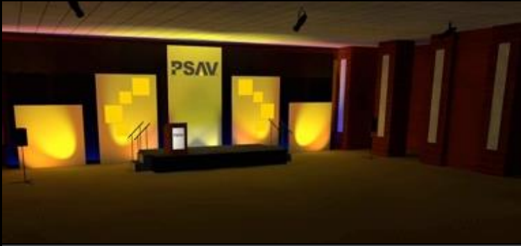
Scenic Flat Solutions Backdrop Pro