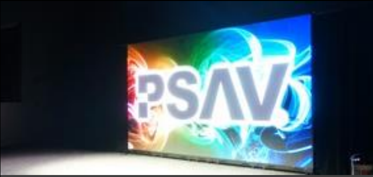
LED Wall Solutions