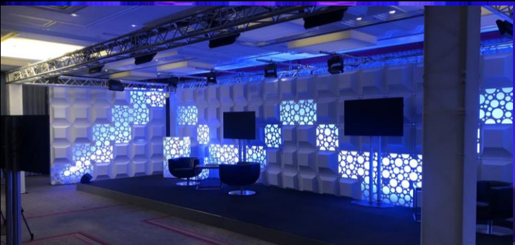
Modular Scenic Tile Solutions

These are a few of the many scenic configurations and furniture options you can select from for your Presentation Stage.